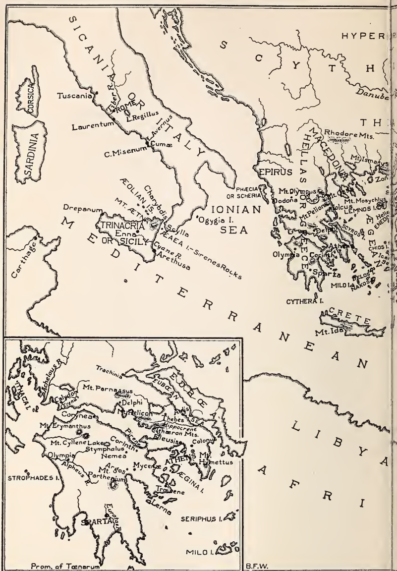
THE WORLD OF THE ANCIENT GREEKS AND ROMANS, SHOWING LOCATIONS